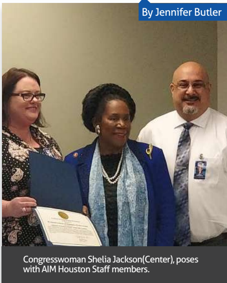
Congresswoman Sheila Jackson (Center), poses with AIM Houston Staff members.

On March 4, 2019, AIM Houston held a lunch roundtable event to celebrate the women of Aviation Institute of Maintenance. Students and staff had the opportunity to connect, discussing career opportunities, challenges, triumphs, and scholarships. After gathering for a group picture, the women were surprised by an inspirational visit from United States Congresswoman Sheila Jackson Lee.