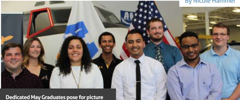
Dedicated May Graduates pose for picture