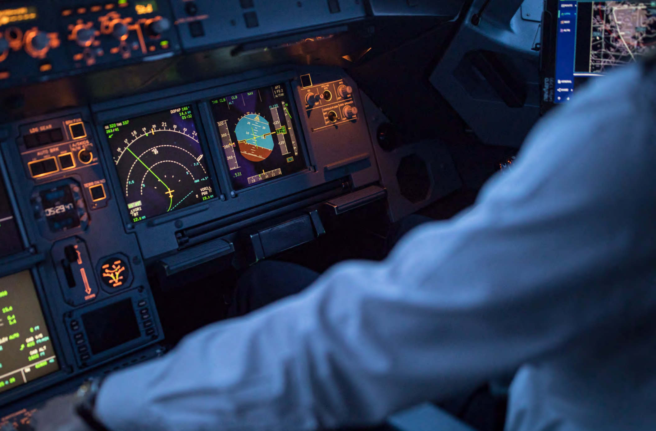
Some imagery depicts career environments and opportunities.